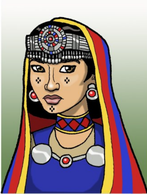
Zaynab an-Nafzawiyyahd (c. 1080-90 CE) Amazigh