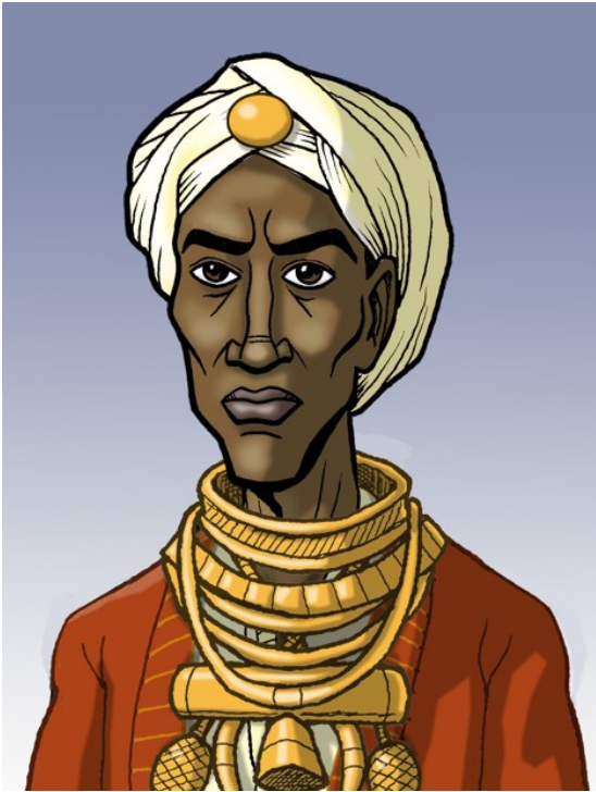
Tunka Manin (r. 1063-10?? CE) Soninke/ Mande