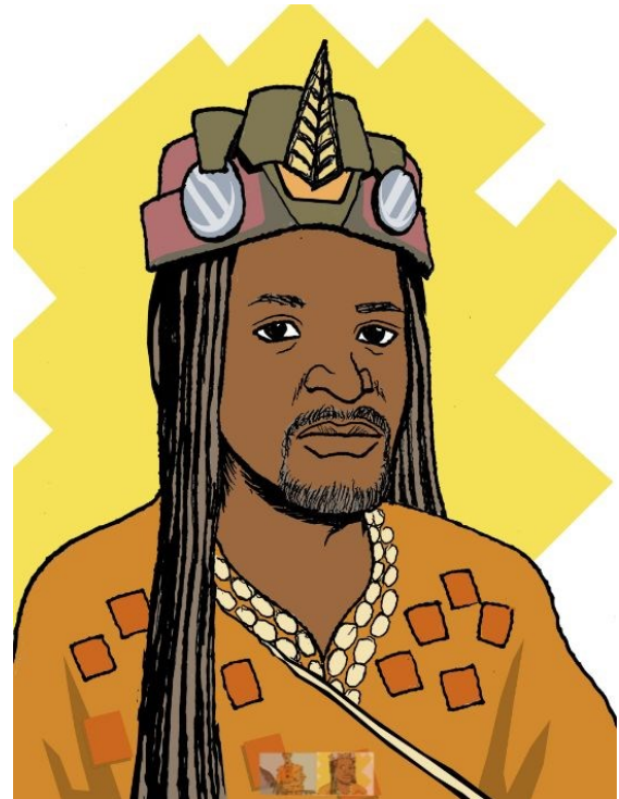
Sumanguru Kante (13 th century CE) Susu / Mande