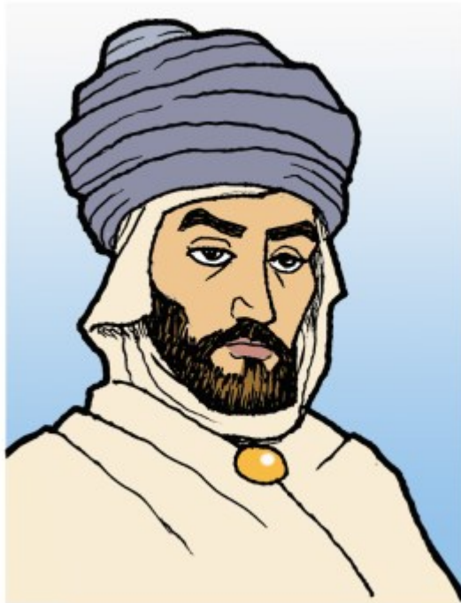
Yahya ibn Ibrahim (d. 1040 CE) Amazigh/Sanhaja