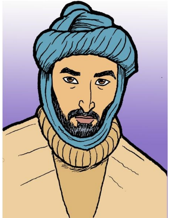
Amazigh, Zanata Trader (c. late 10 th century CE) Amazigh/ Zanata