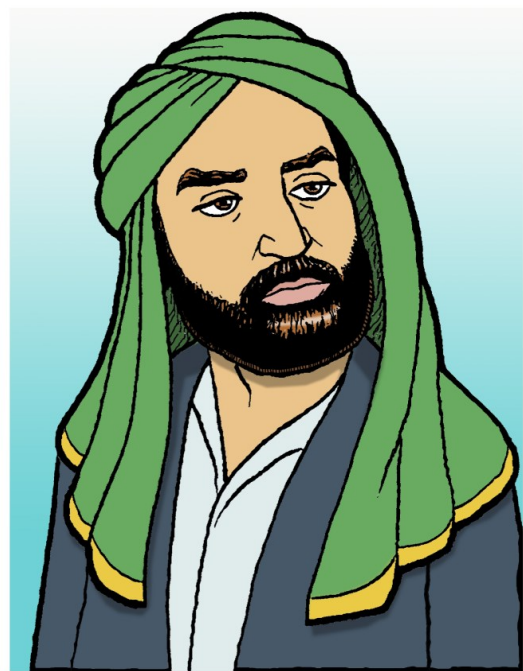
Abu Bakr ibn Umar (d.1087 CE)