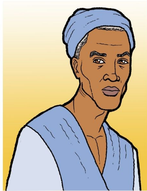
King Basi (?—1063 CE)