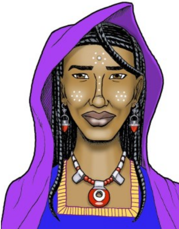
Bouctou (12 th century CE) Amazigh/ Tuareg