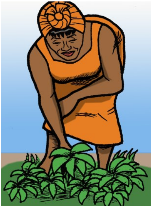
Farmer (10th century CE ) Soninke/ Mande