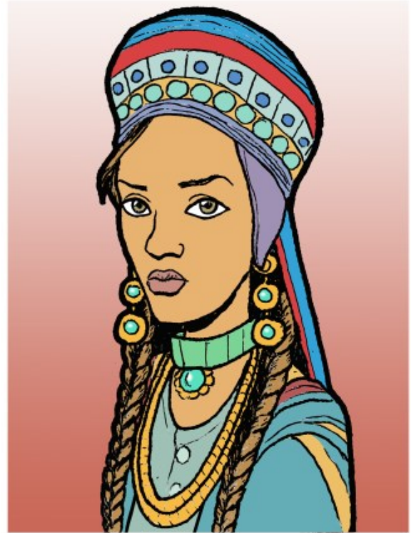
Resident of Awdaghust Amazigh