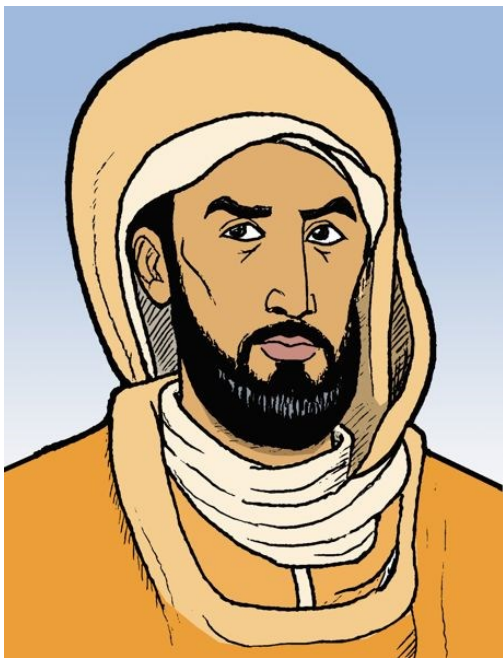
Abdallah Ibn Yasin (d. 1059 CE)