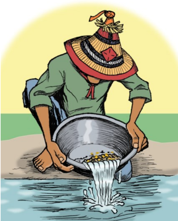
Gold miner (late 10th century CE)