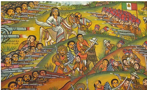
Battle of Adwa