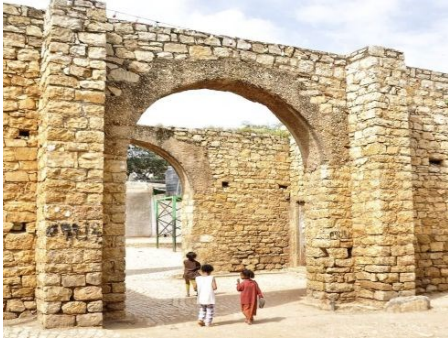
Walled city of Harar